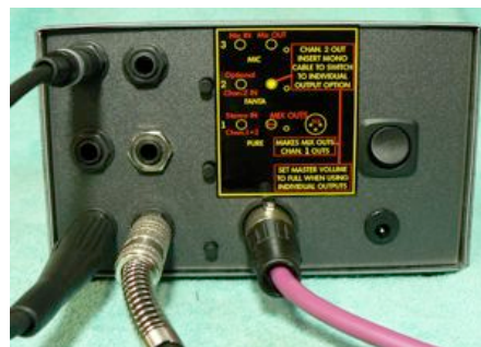
Typical input and line-mix-out (silver plug) setting -or- setting with both, line- and XLR-mix-outs