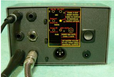
Stereo plug Ch. 1 IN (line-mix out shown)

The input of channel 1 is a T-R-S (tip-ring-sleeve) stereo connector. It is configured TIP to channel 1, RING to channel 2. If you use a stereo cable here, this input will distribute the input signal to channels 1 + 2. If a mono cable is used here it will get you channel 1 only. The inputs of channel 2 and 3 are both mono 1/4".