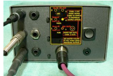
3 mono plugs used (XLR-mix-out shown)