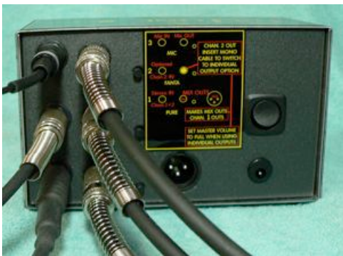
or: IN ch.1 stereo plug

The individual output of channel 2 ( silver nut ) switches the unit into the individual output mode. If a mono 1/4" cable is inserted here both mix-outputs (line and XLR) are switched to channel 1 individual outputs. The cable you plugged into channel 2 out will carry channel 2 only. The 1/4" output of the mic channel carries the mic signal only (this one is actually always available as individual output, it works in mix-out mode as well). The individual output mode requires you to set the master-volume to full and leave it there. Use the individual channel volume controls to adjust the 3 volumes.